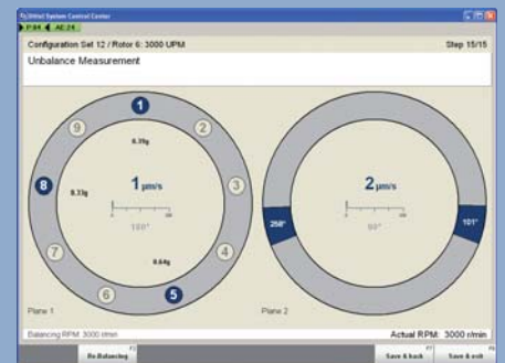
2 plane balancing (fixed position and spread angle method)