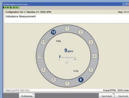
1 plane balancing (fixed position method)